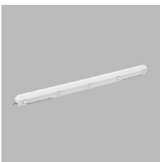
DUSTER II 120 35W 4000K 5150 lm