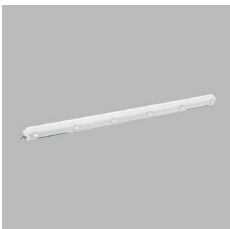
DUSTER II 150 52W 4000K 7500 lm