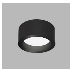
KAPA ON 14