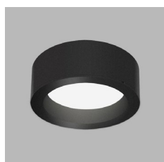
KAPA ON 19