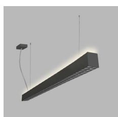
LINO LASER Z 120